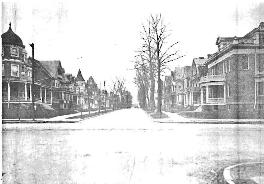
NO. 2 — HOME ON BENTLEY AVENUE